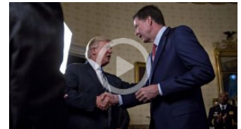
Donald Trump Finally Breaks His Silence On James Comey's Testimony